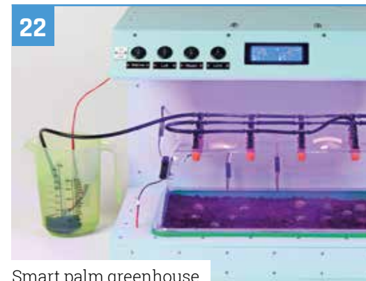
Smart palm greenhouse