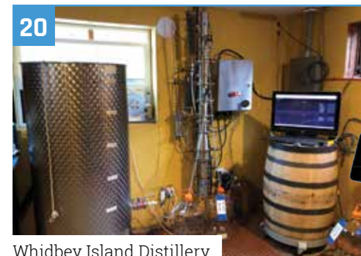
Whidbey Island Distillery