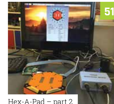
Hex-A-Pad – part 2